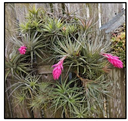
Tillandsia stricta 'Black Beauty'

Send in your photos and articles about bromeliad events, blooms in your garden, or newspaper and magazine articles that may be of interest to our members. Email Jane at saravillalobos387@gmail.com.