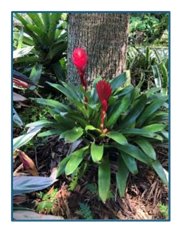
Vriesea splendens