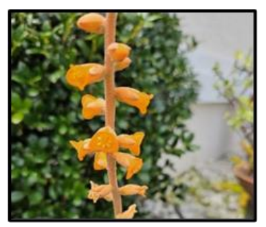
Dyckia 'Silver Dragon'