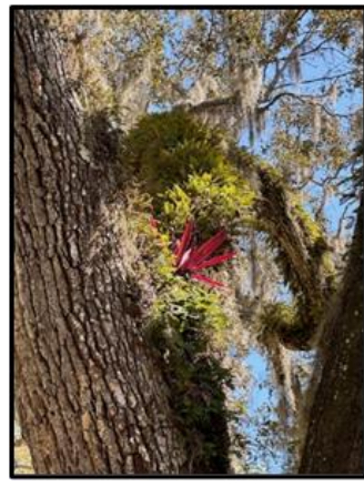
Bromeliads at Sugar Mill Gardens